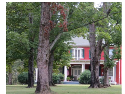
Woodlon Hall, Nashville, TN

Although programming will not begin until Friday afternoon at 3 p.m., you can reserve at the special room rate of $135 (for up to 3 people) from Thursday night, August 16. If this is your first Gathering, we look forward to seeing you and spending time learning about our mutual family histories. If you're a returning participant, we can't wait to see you!