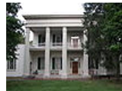
The Hermitage, Nashville, TN

Our final day will include a trip to the Red River Meeting House. This site is important to us because of its affiliation with cofounder of the Cumberland Presbyterians, Rev. Finis Ewing. We will be able to take a look at this Logan County, KY, landmark before we adjourn. A full schedule of events will be published in the May 2018 issue of the Ewing Family Journal, but you can reserve your room right now. Call the Millennium Maxwell House Hotel at 615-259-4343 . Be sure to mention that you are booking your room as part of the Ewing Family Association event. Starting in May, you'll also be able to register for the Gathering by mail or by visiting www.ewingfamilyassociation.org or the Ewing Family Facebook page.